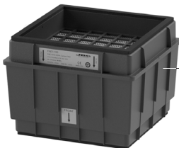
H13 Filter & Carbon Filter