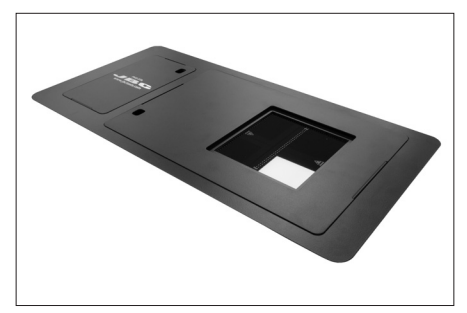
1 Protect your work space except of the heating area with the workbench cover (Ref. 0019592).

Cover and protect the work space according to your work needs.