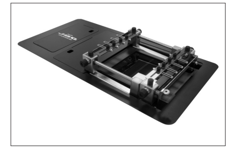
2 If you work with a preheater support (Ref. PHS-SA) protect the work space with the small workbench cover (Ref. 0019592).